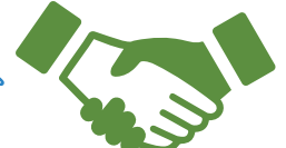
DOMESTIC AND INTERNATIONAL INVESTORS

Farm Credit's mission remains just as vital today as it was when we made our first loan more than 100 years ago. For more information about how Farm Credit supports rural communities and agriculture, please visit farmcredit.com/overview-and-mission .