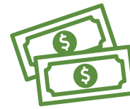
FFCB FUNDING CORPORATION