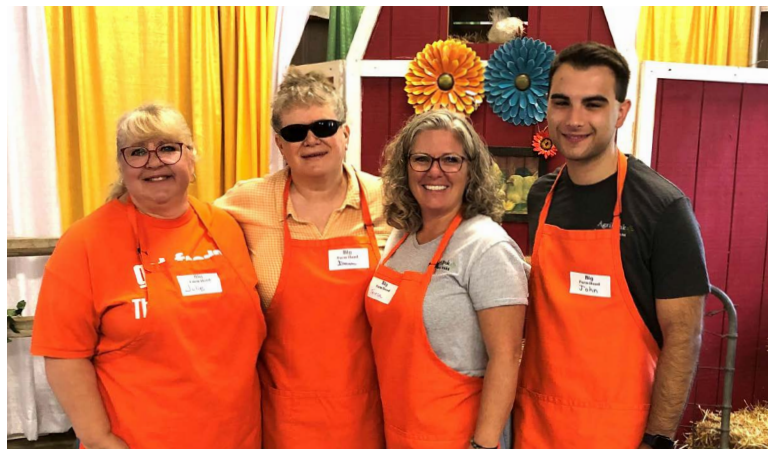
AgriBank employees at Little Farm Hands event

For more information, go to AgriBank.com > Community .