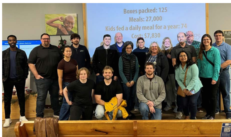
AgriBank employees at Feed My Starving Children

For more information, go to AgriBank.com > Community .